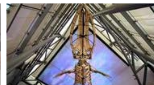
Photos: Natural History Museum's evolution