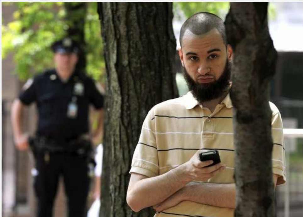
An NYPD officer and a man look on as civil rights and legal advocates and residents hold a news conference in New York outside One Police Plaza to discuss planned legal action challenging the department's surveillance of businesses frequented by Muslim residents and area mosques. (June 18, 2013)