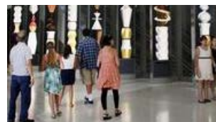
Photos: LAX's Tom Bradley International Terminal