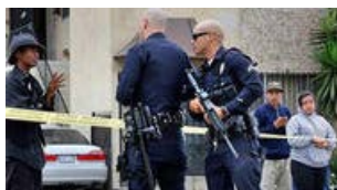
Photos: LAPD detectives wounded in ambush