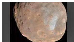
Photos: Moons of the solar system