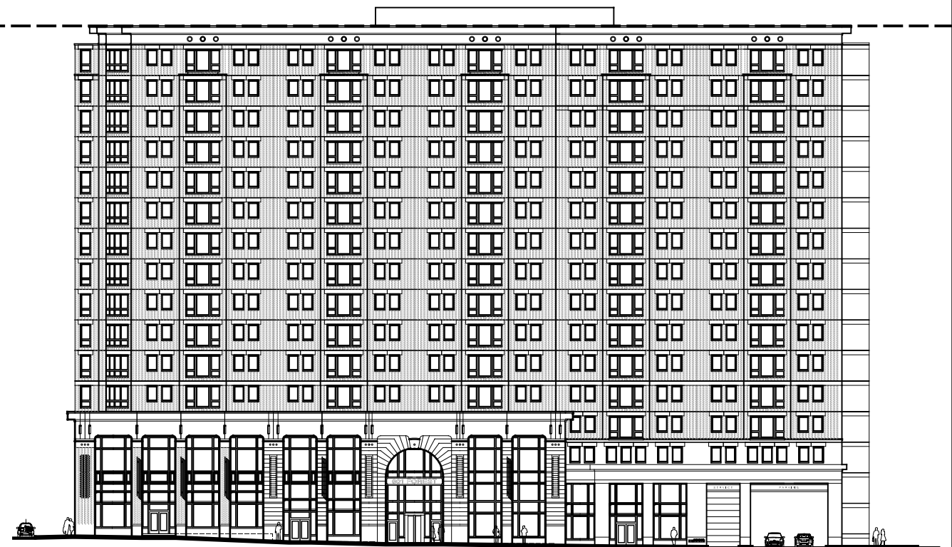
CONCEPTUAL WEST ELEVATION - AS PROPOSED SITE PLAN REDUCTION